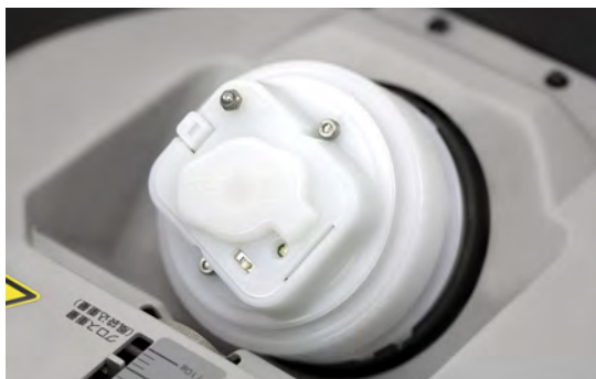
The picture taken with ARV-310P